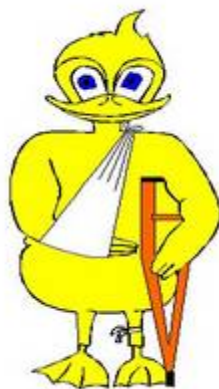
Harry the Hydro Duck

In short virtually any condition you can think of.