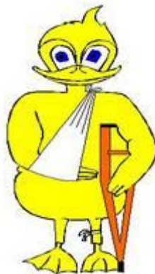
Harry the Hydro Duck

In short virtually any condition you can think of.